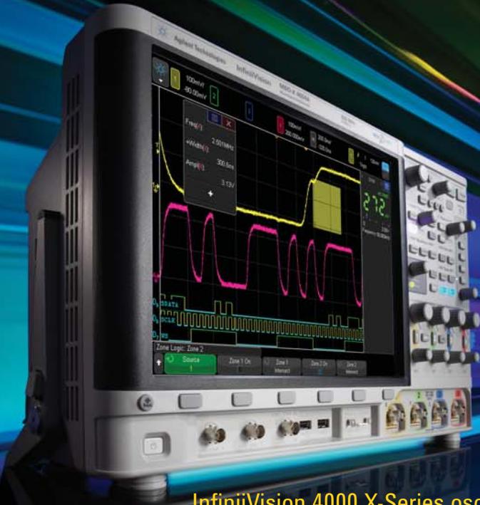
InfiniiVision 4000 X-Series oscilloscopes

Contact your Agilent Technologies' authorized distributor or designated reseller. Find an authorized distributor: www.agilent.com/find/distributor